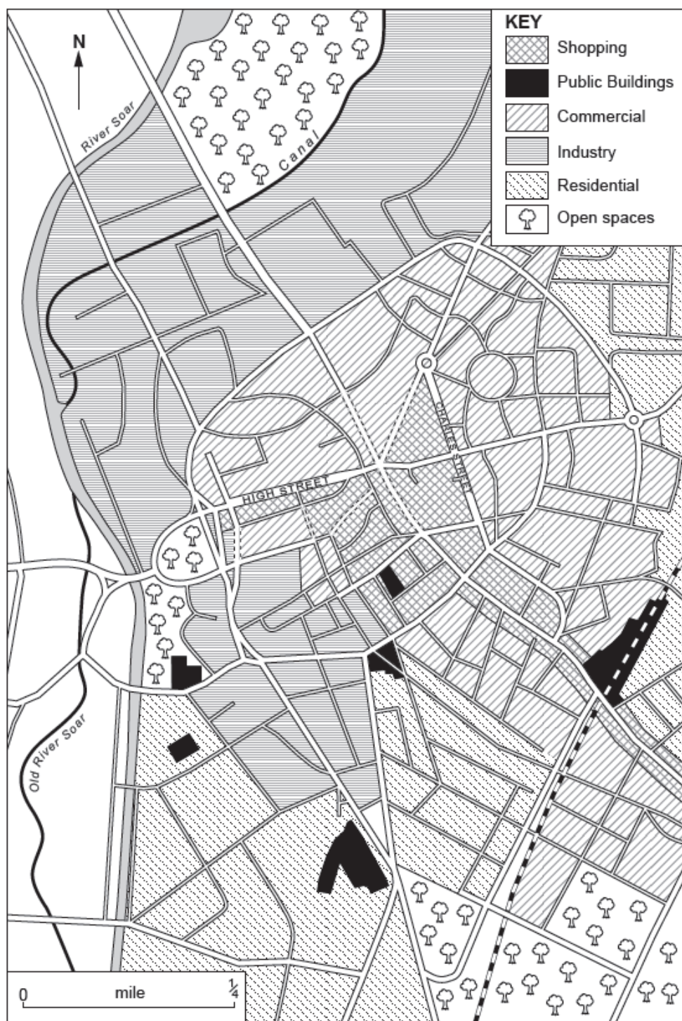
Figure 3: A choropleth map showing urban land use in a UK town in 1967

In your answers to Section B you should include evidence from your fieldwork investigations in physical geography and human geography.