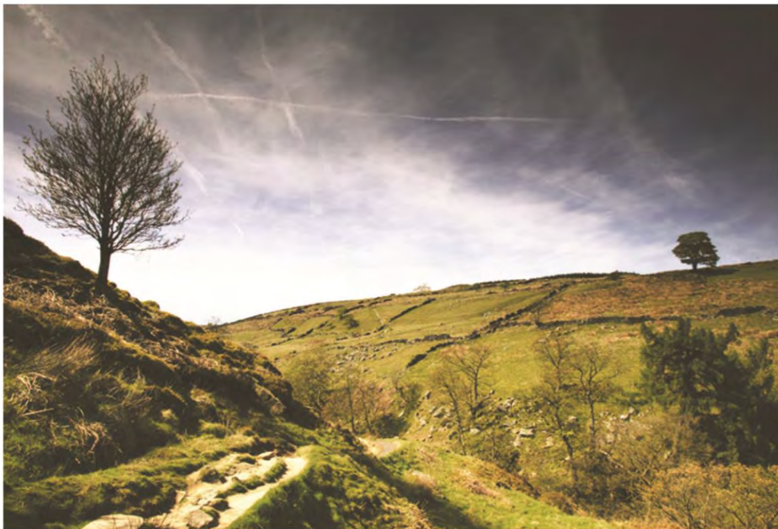
Figure 2: A new plan for Thornton Moor